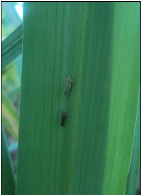
Fig 4: Male and female leafhoppers on cane leaf

Fiji leaf gall disease is caused by a reovirus, Fiji disease virus (FDV).