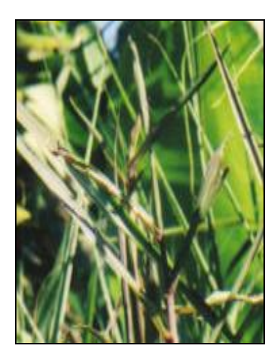
Fig 3: Cane top 'bitten off' symptom