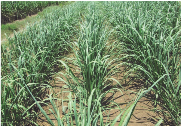
Result of early post emergence

Weeds grasses and broad leaf have started to germinate and this is the ideal time to apply early post emergence weedicides.